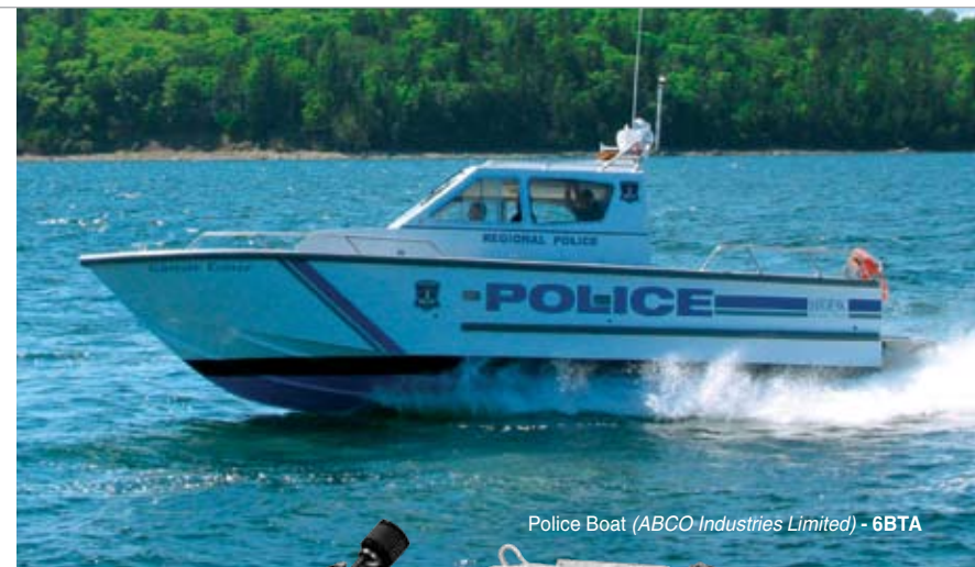
Police Boat (ABC Industries Limited) - 6BTA