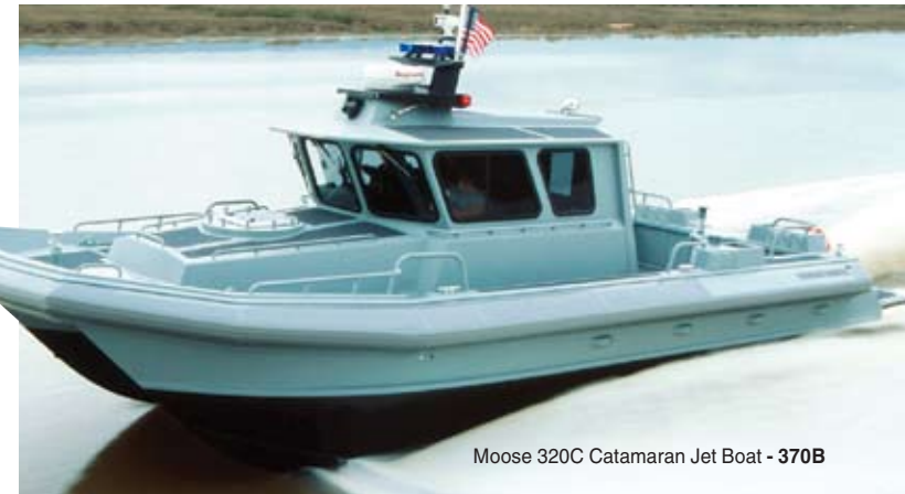
Moose 320C Catamaran Jet Boat - 370B

The Moose 320C is a 33' 6" all aluminum jet-powered catamaran with twin Cummins MerCruiser Diesel engines. This vessel can attain a top speed of over 35 knots, cruise at approximately 28 knots, come to a full-speed stop in less than two boat lengths and turn on a dime. Its 21" draft allows all of this to be done in less than 3' of water. The craft is fully equipped for law enforcement, search and rescue efforts and firefighting capabilities. Reliability is paramount since the mission of this vessel is to provide quick responses for marine emergencies.