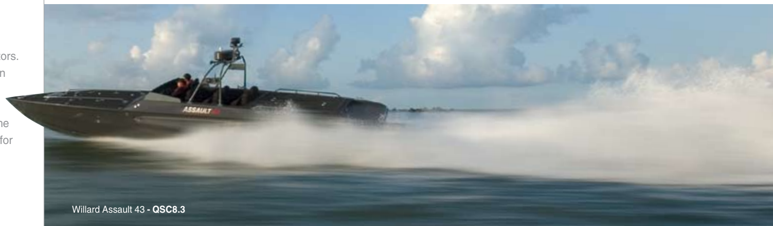
Willard Assault 43 - QSC8.3

The Assault 43 R.I.B. is a new concept for safe, fast and comfortable high-speed interceptors. The 43' Scarab designed hull is powered by twin CMD QSC8.3 diesels. This vessel can attain a top speed of 65 knots and stay on plane at lower speeds. The durability and versatility of the QSC8.3 is a perfect fit for the growing demand for increased performance on this class of boat.