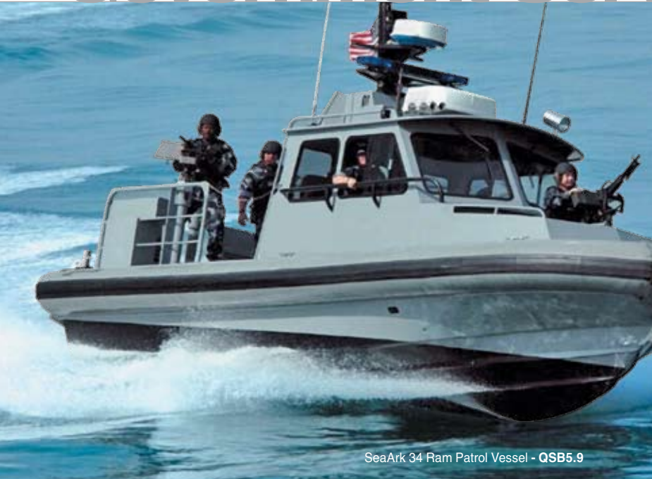
SeaArk 34 Ram Patrol Vessel - QSB5.9